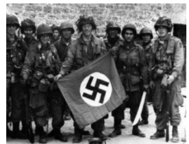
Violent antifascist thugs pose with a banner stolen from a gathering of right wing demonstrators, 1944

That said, it should be noted that 99% of anti-fascist work doesn't involve violence at all. The day-to-day research, communications, education, and solidarity work that comprises the overwhelming majority of what anti-fascists do might not make headlines but it's what gets the job done. Most antifa will never encounter a violent situation in the course of their activities.