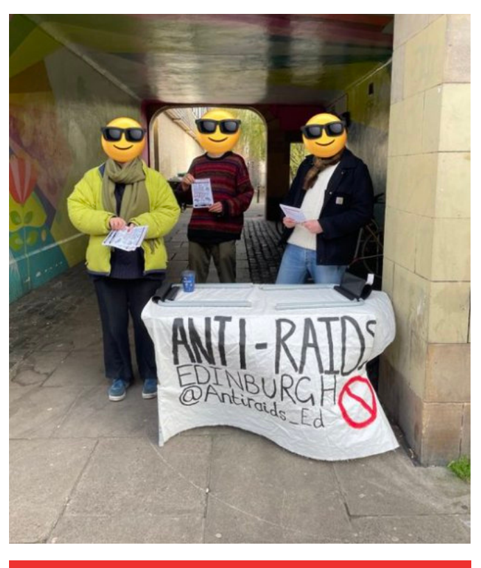
Above: antifascists in Edinburgh, Scotland run an info table to provide resources and tips to the public on how to support their neighbours in the face of immigration raids by the state.

(1): bit.ly/2022ViolentHateCrimes [2]: bit.ly/2022violenthatecrimesmap