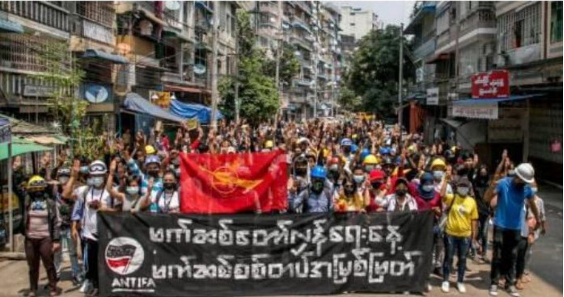
Above: antifascists in Yangon, Myanmar take to the streets to protest the military junta's coup and dictatorial rule, March 2022

It should be noted that Washington, D.C., New York City both made the top ten list for the second year running while Portland, OR. has been in the top ten three years in a row. The seven other cities make their first appearance in the top ten list in 2022.