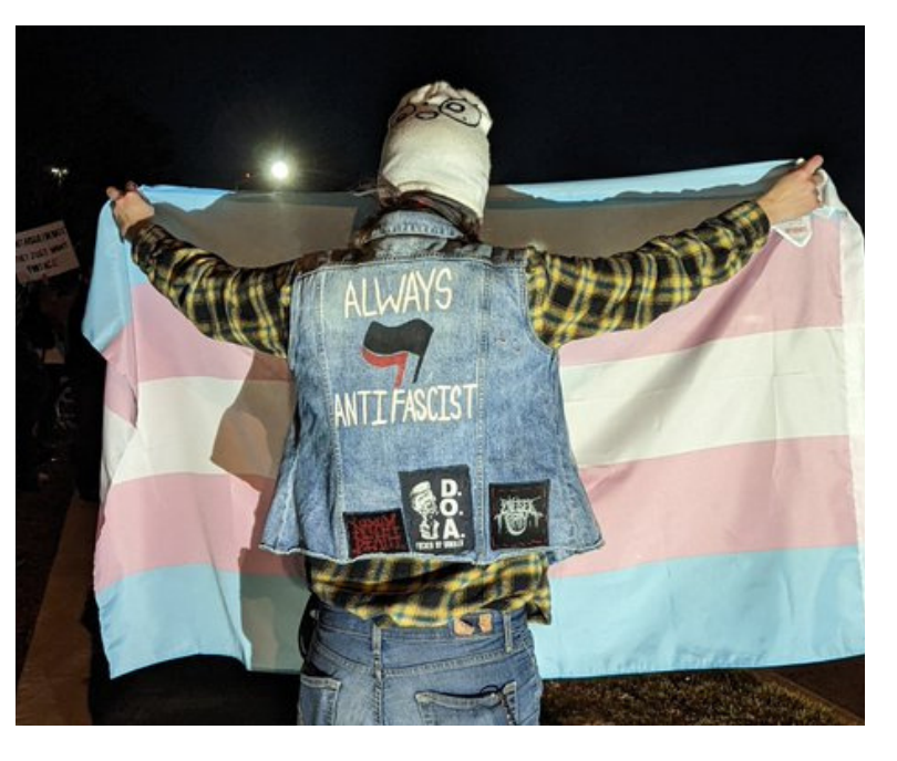
Cover photo: antifascists gather in Paris to mark the anniversary of the murder of 18-year--old antifasciste Clément Méric, who was stabbed to death by nazis in 2013. Above: an antifascist in Grand Prairie, TX defends a drag show from a mob of armed transphobes and nazis.

*(a new category we tracked in 2022, we define a "mob beating" as one involving three or more assailants)