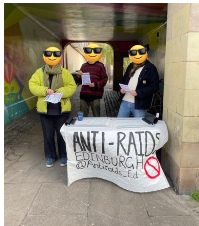
Above: antifascists in Edinburgh, Scotland run an info table to provide resources and tips to the public on how to support their neighbours in the face of immigration raids by the state.