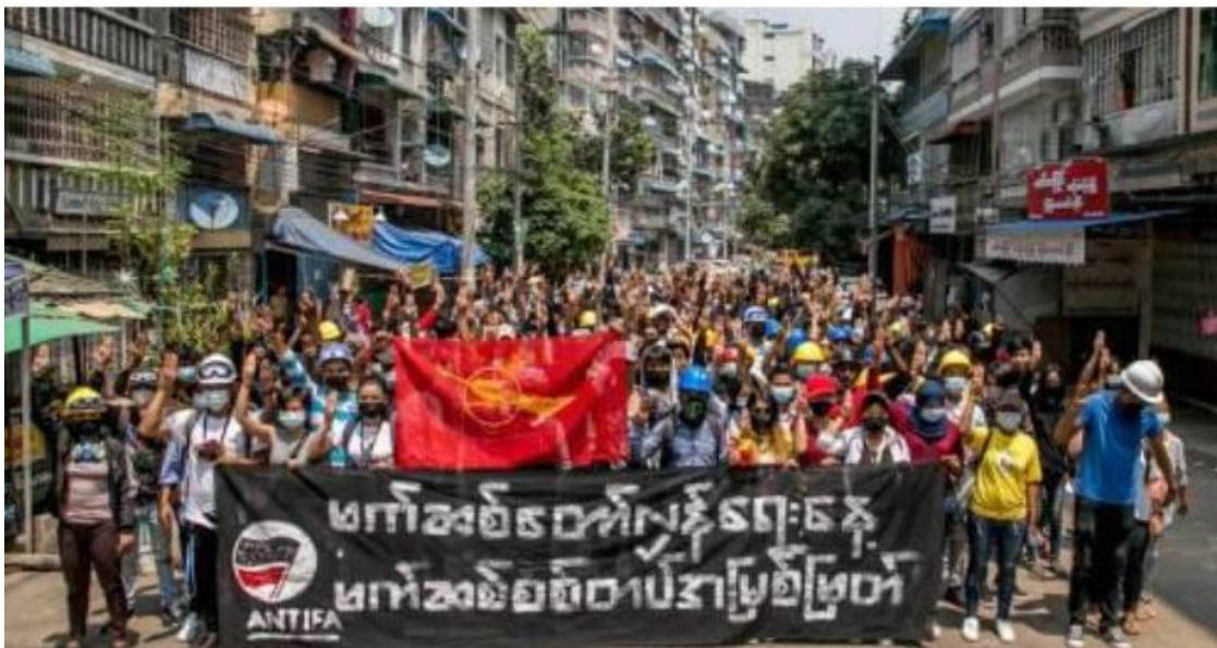
Above: antifascists in Yangon, Myanmar take to the streets to protest the military junta's coup and dictatorial rule, March 2022

It should be noted that Washington, D.C., New York City both made the top ten list for the second year running while Portland, OR. has been in the top ten three years in a row. The seven other cities make their first appearance in the top ten list in 2022.