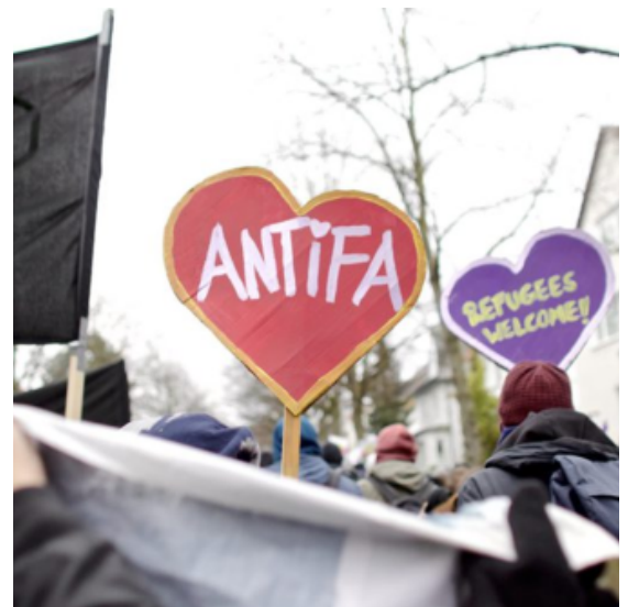
Above: an anti-fascist demonstration in Niedersachsen, Germany