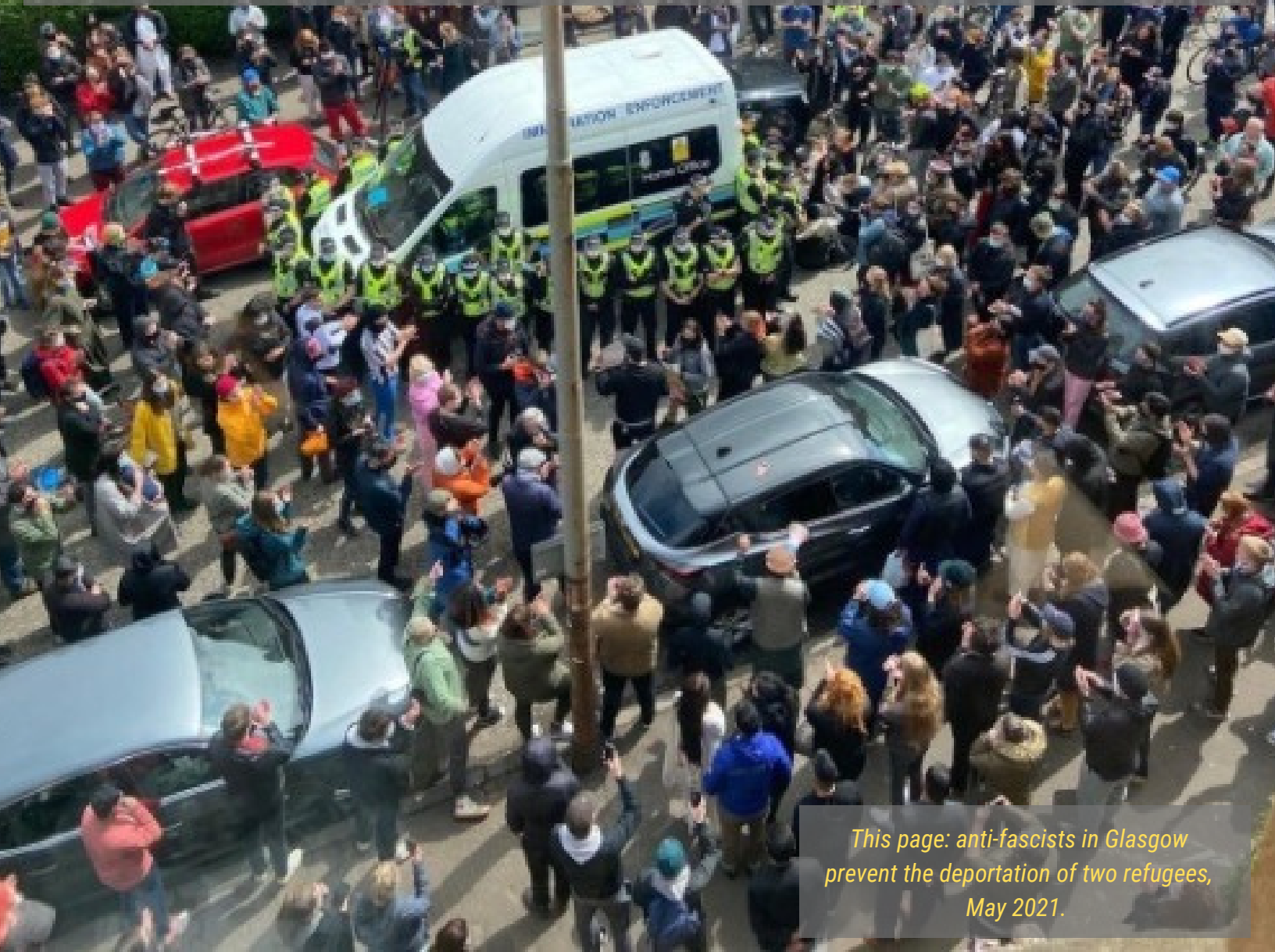
This page: anti-fascists in Glasgow prevent the deportation of two refugees, May 2021.

If you are a researcher interested in collaborating with us, please get in touch! antifaintl@protonmail.com